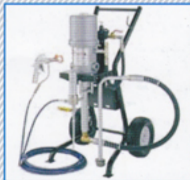
LIQUID PAINTING EQUIPMENT