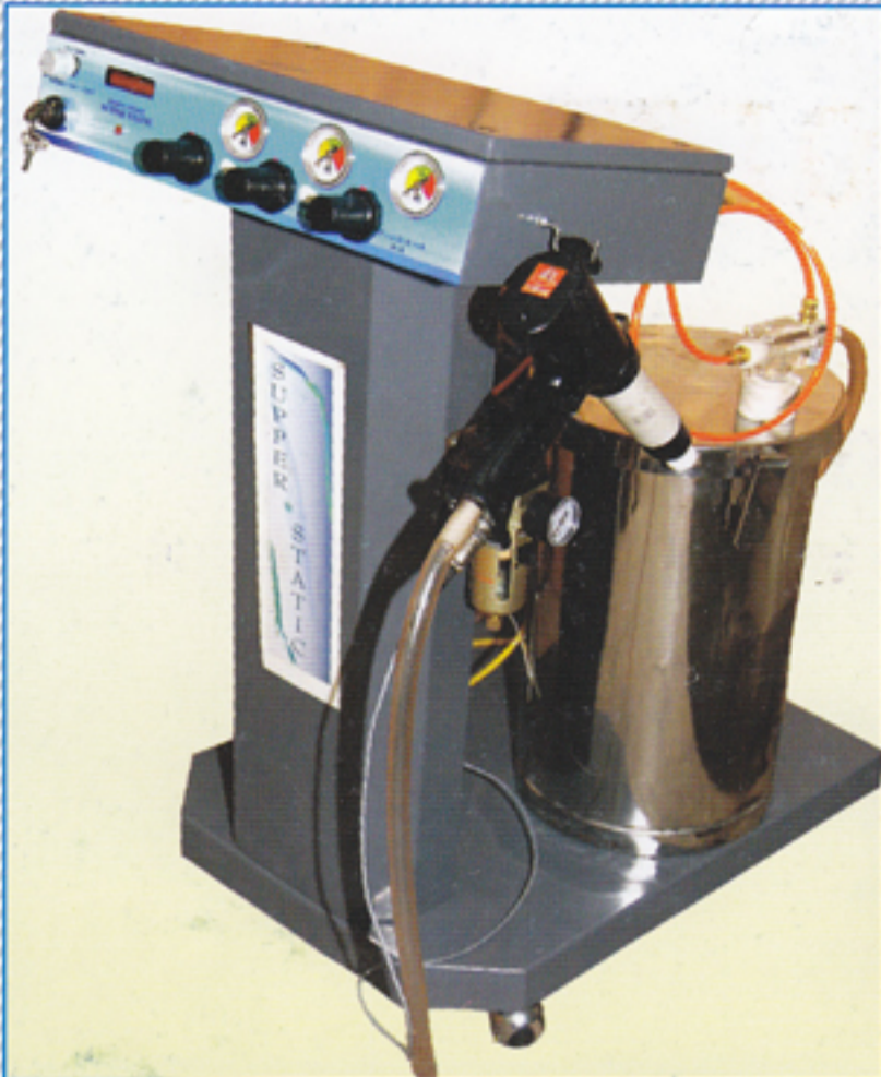
ELECTROSTATIC POWDER APPLICATION EQUIPMENT