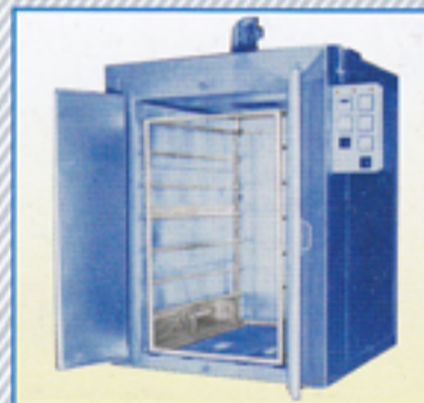
HEATING OVEN / CURING OVEN