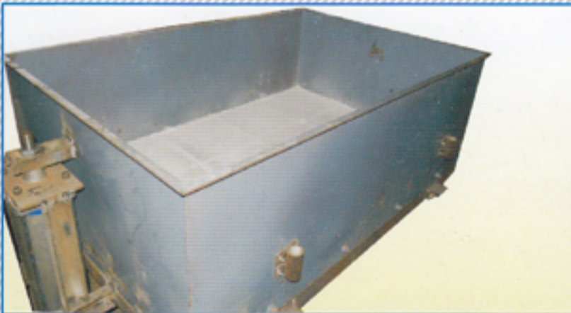
NON ELECTROSTATIC FLUIDIZED BED