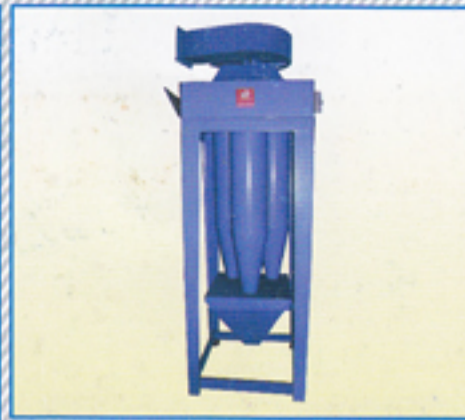
POWDER SPRAY CUM RECOVERY BOOTH