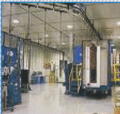
MATERIAL HANDLING & MOVEMENT